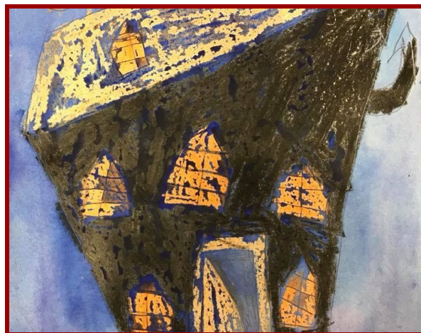
Art Teacher Magen Peigelbeck organized and spearheaded this multi-faceted STEAM event which covered all aspects of the "A" (Arts) of STEAM.